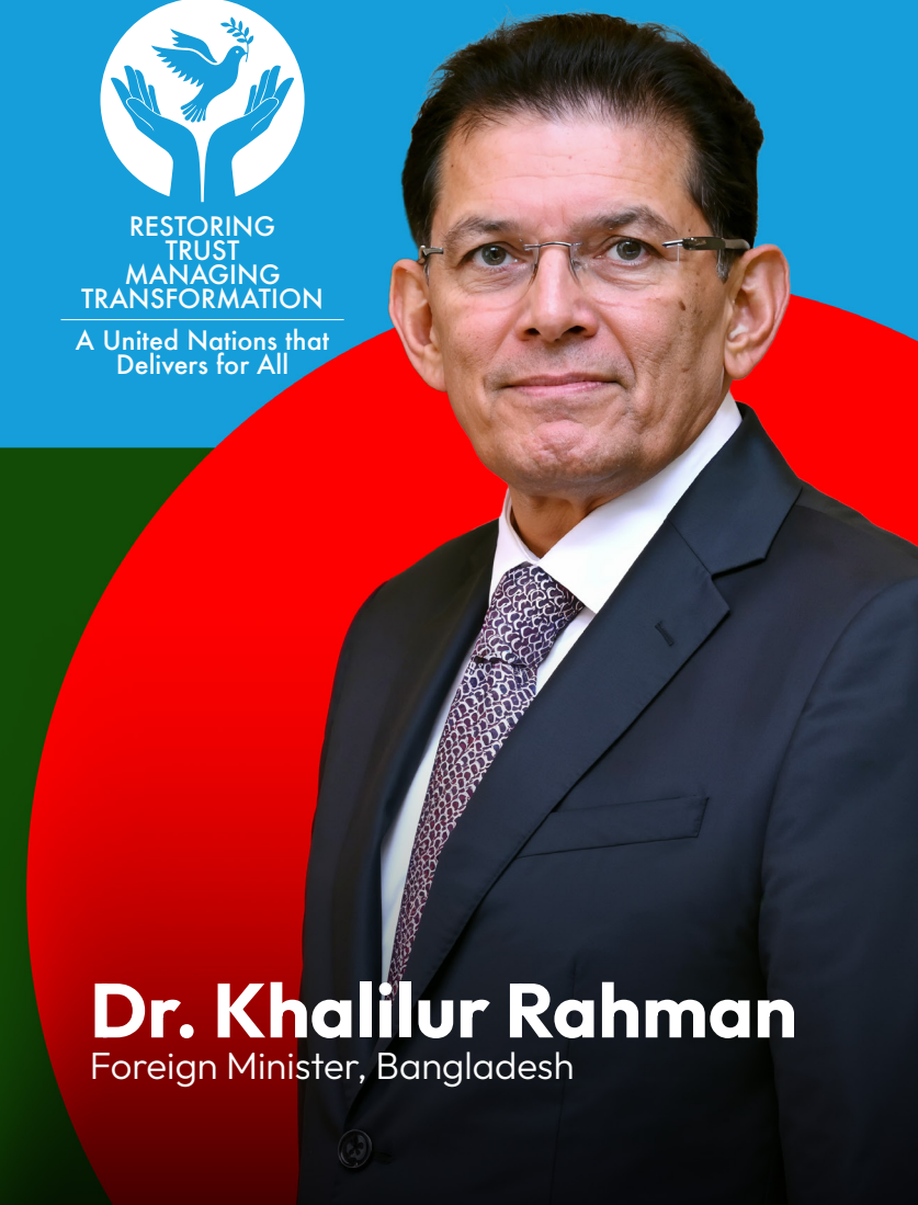
Dr. Khalilur Rahman Foreign Minister, Bangladesh

RESTORING TRUST MANAGING TRANSFORMATION A United Nations that Delivers for All